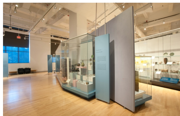
The Korean Gallery