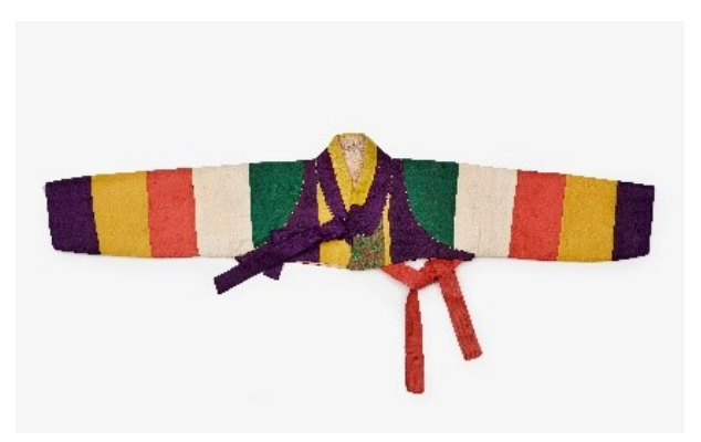
Eight-Panel Folding Screen of One Hundred Boys at Play; Ink and colour on coarse silk; Korea, Early 20th century AD, Silk tabby with appliqued yoke and cotton gauze and silk ties; Early 20th century