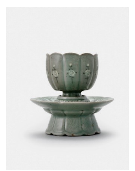
Flower-shaped Cup and Stand Wheel-thrown stoneware with inlaid design under celadon glaze; Korea, Goryeo Dynasty, 13th century AD