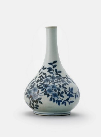
Bottle with Flowering Plant Design | Wheel-thrown porcelain with cobalt-blue paint and glaze; Korea, 19th century AD, Joseon Dynasty